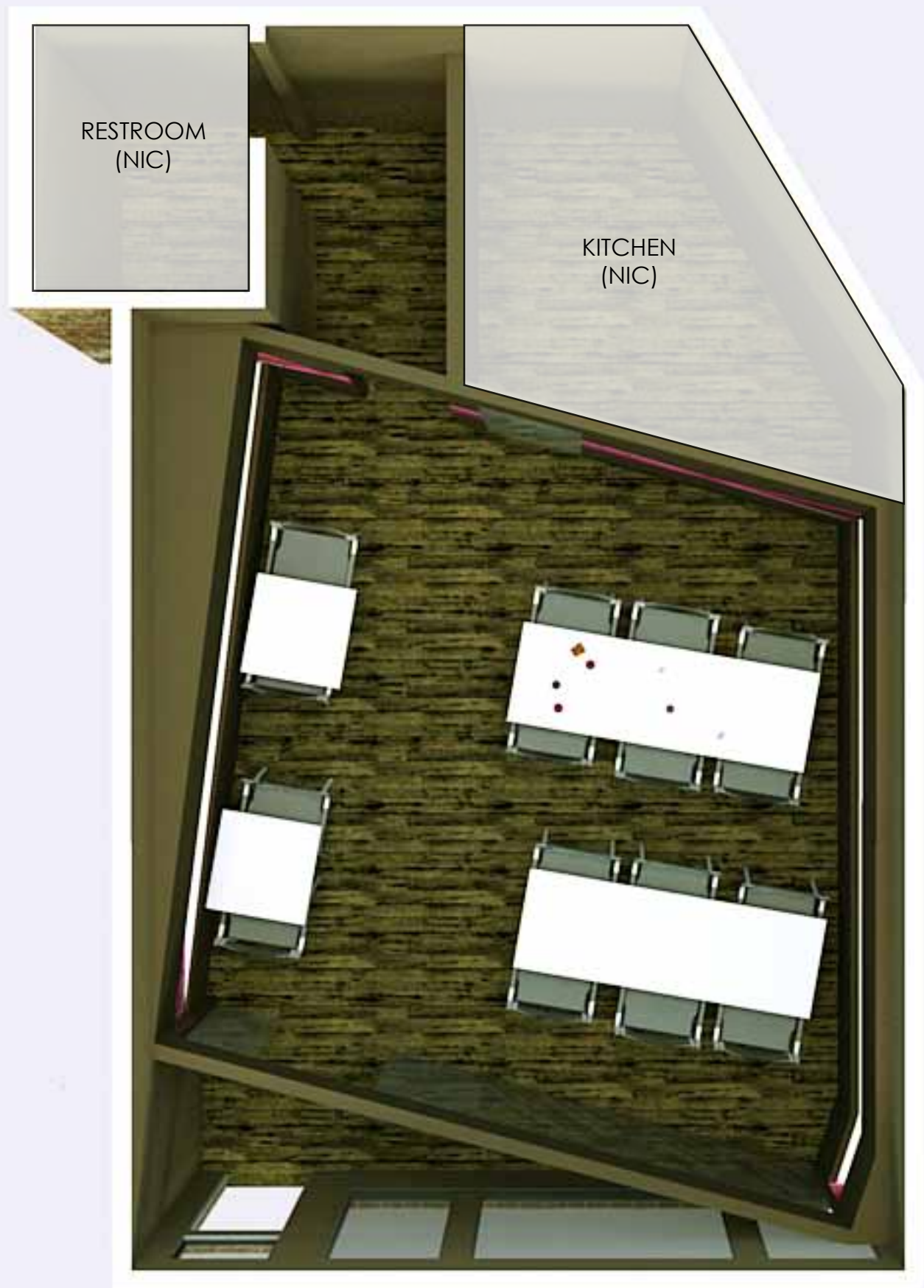
AXON PLAN NTS